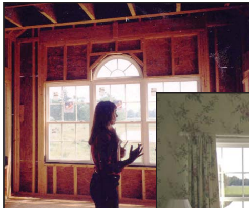
Before and after photos of Seabiscuit model home for Magness Construction's Sugar Loaf Farms.

For more information visit the websites: www.barkitecturede.org www.faithfulfriends.us or call: 302-427-8514